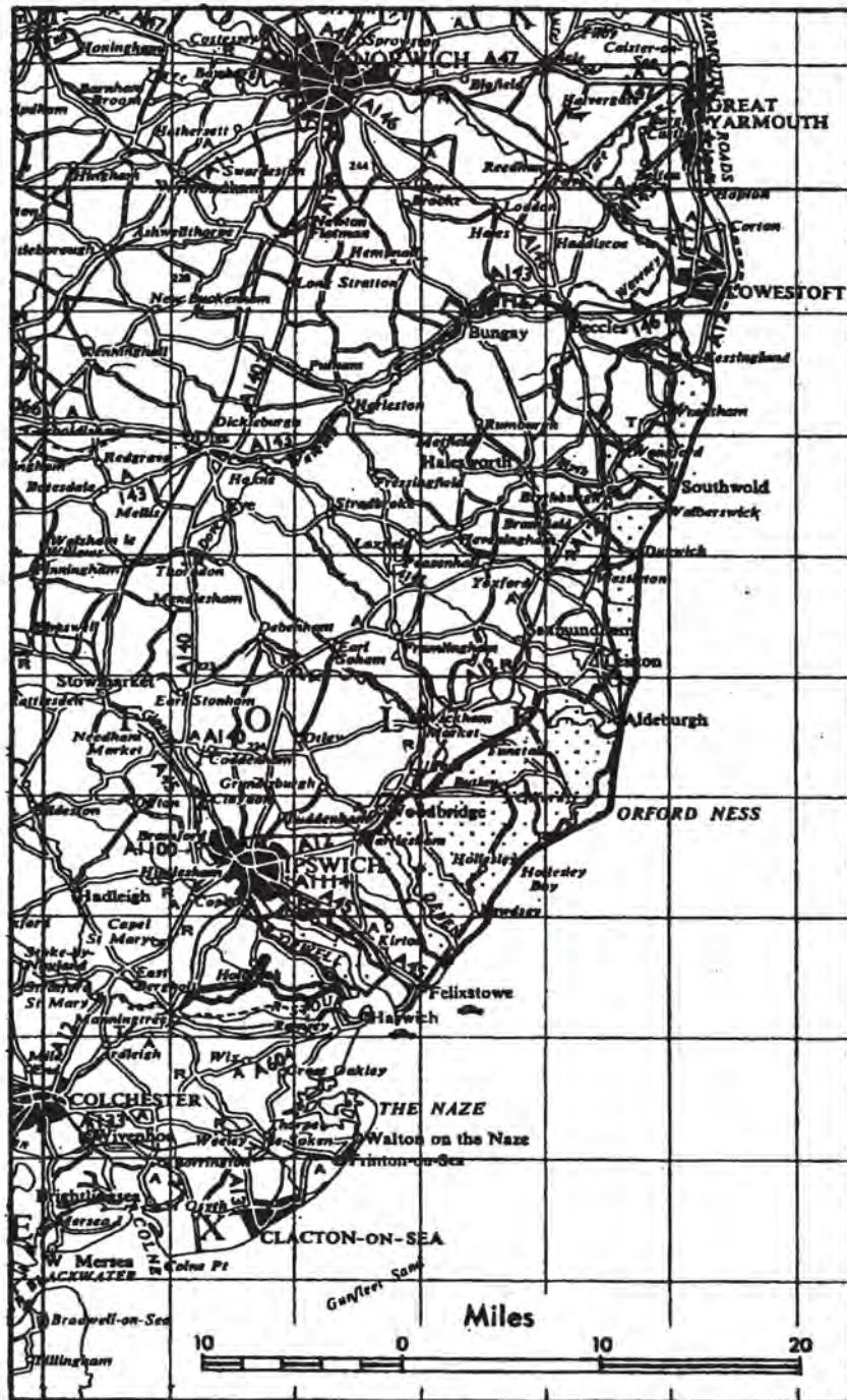
MAP 2 SUFFOLK COAST AND HEATHS AONB